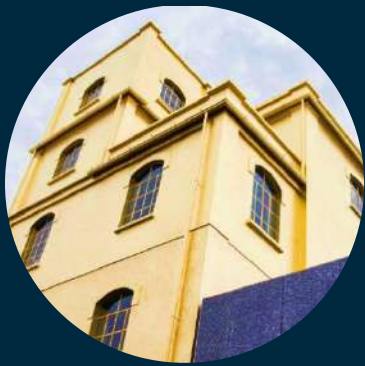
Fondazione PRADA Metro "yellow-line" "Lodi T.I.B.B."

If Duomo is the historical center of Milan, Citylife represents the city's new face, the one that always looks to the future. Thousands of tourists also go to visit Bosco Verticale, winner of the International Highrise Award and nominated Best World Architecture in 2015.