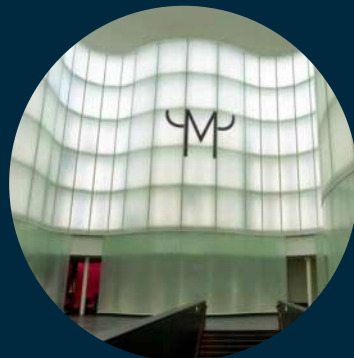
MUDEC Metro Green-line » PORTA GENOVA