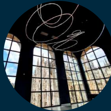
MUSEO DEL 900 Metro Red-line » DUOMO