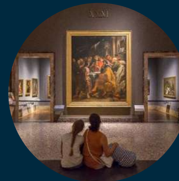
PINACOTECA DI BRERA Metro Green-line » LANZA