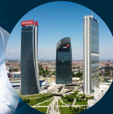
Citylife Metro "lilla-line" » "Tre Torri" Metro "Red-line" » "Amendola"