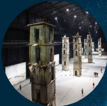
Hangar Bicocca Metro "lilla-line" "Bicocca"