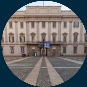
PALAZZO REALE Metro Red line » DUOMO

FIE FENCING WORLD CHAMPIONSHIPS MILAN 2023