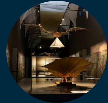
MUSEO LEONARDO DA VINCI Metro Green-line » S. Ambrogio