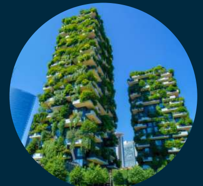
Bosco verticale Metro "green-line" "GARIBALDI f.s."

There are uncountable places in Milan where people can appreciate Made in Italy design expressions, such as Fondazione Prada, center of contemporary art and modern culture, and Hangar Bicocca, one of the biggest art show-room in Europe.